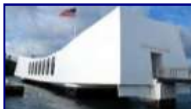
USS Arizona Memorial

We would be fighting on 2 fronts, as Germany and Italy declared war on us the day after our Declaration of War against Japan, December 9, 1941, leading to nearly 4 years of some of the bloodiest fighting in human history.