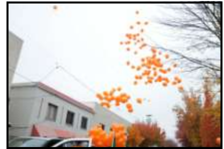
Orange Balloons released during the Veterans Day Parade

Our AVVA monthly chapter meetings will be held on the fourth Tuesday of each month at Zen's Mongolian Grill 1969 SE Stephens, Roseburg at 1800 hrs. 6:00 pm.