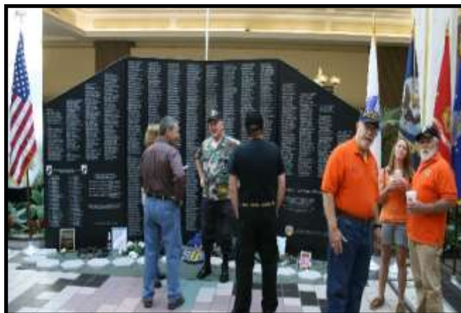
Picture of the Traveling Tennessee Vietnam Veterans Memorial Wall . Our Chapter has taken on the project to construct a similar Wall Honoring all Oregon Vietnam Veterans who paid the ultimate price .