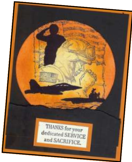
AVVA Story on Page Three