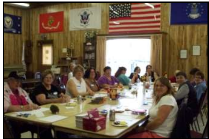
AVVA Chapter members and volunteers are seen making custom Veteran Day Cards. The 150 handmade cards (sample on the left) will be distributed to Veterans on Veterans Day at the VA Hospital and other local care facilities.