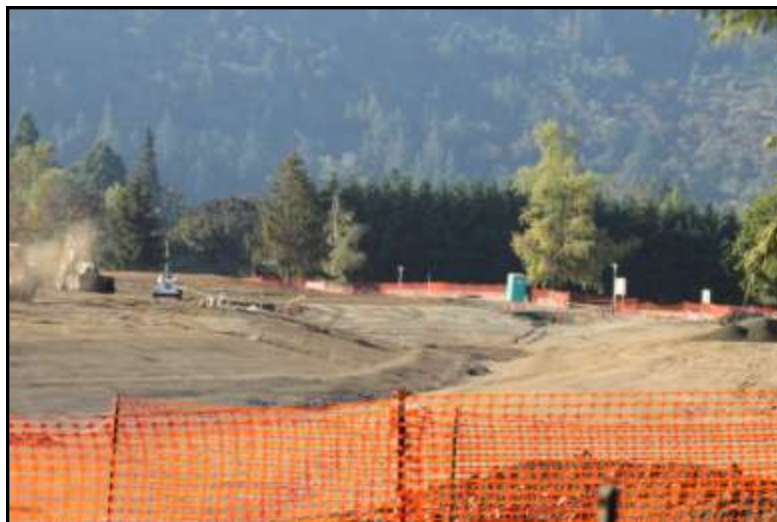
Under Construction—Roseburg VA National Cemetery Expansion