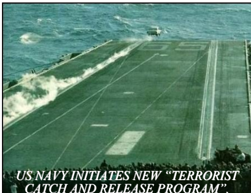
US NAVY INITIATES NEW "TERRORIST CATCH AND RELEASE PROGRAM".

A conscience is what hurts when all your other parts feel so good. Eat well, stay fit, die anyway. There is always one more imbecile than you counted on. Someone who thinks logically provides a nice contrast to the real world.